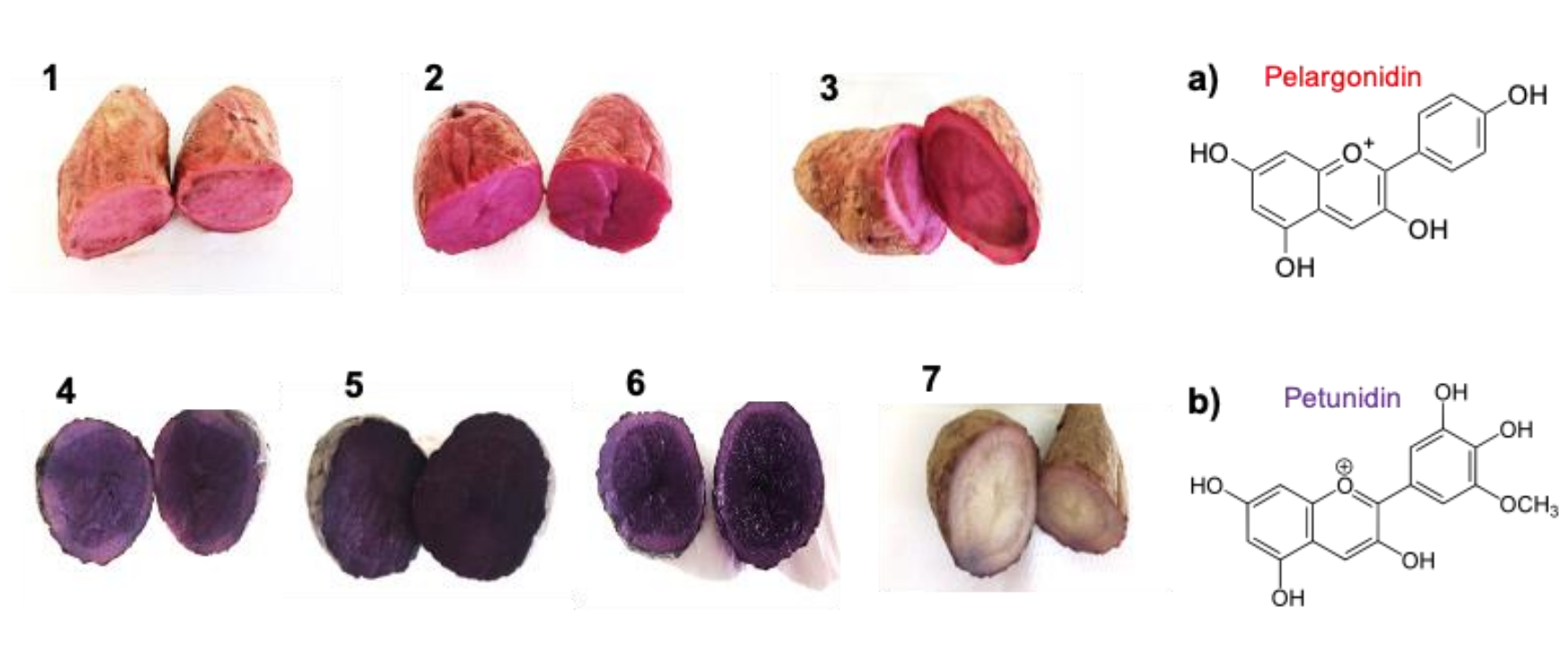
Figure 1. Fresh potato tubers of the genotypes: 1 – Rosemary; 2 - Red Emmalie; 3 - Red Cardinal; 4 – Purple; 5 – Violetta; 6 - Kefermarkter Blaue; 7 – Shetland Black, and the main class of anthocyanidins found in a) red-fleshed varieties and b) purple-fleshed varieties.